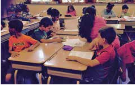
Third grade class at Maple Street School sharing stories from their published book.

Northern Connecticut Land Trust at several of their properties. • Strong Family Farm provided a taste of farm life including programs for children, a farm stand and the recent Fall Harvest Festival.