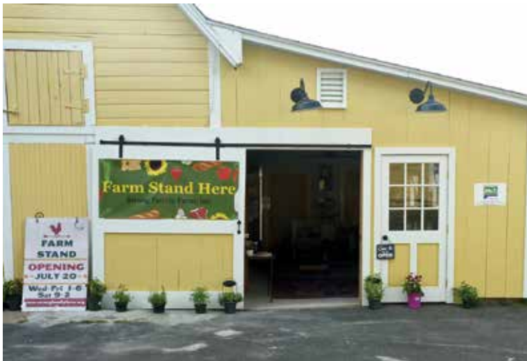
The Strong Family Farm's new farm stand opened this summer.