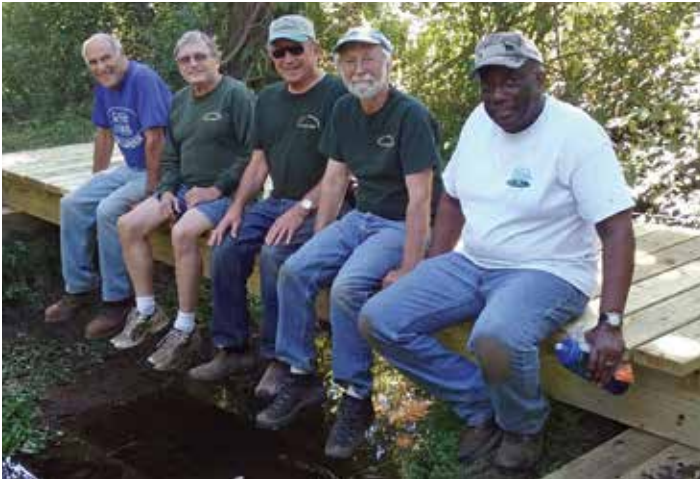
Vernon Greenways Volunteers rest on completed bridge.

Not every project is a big one and many of the smaller ones are worth noting. Following are some of the accomplishments of Vernon Volunteers' Collaborative organizations this year.