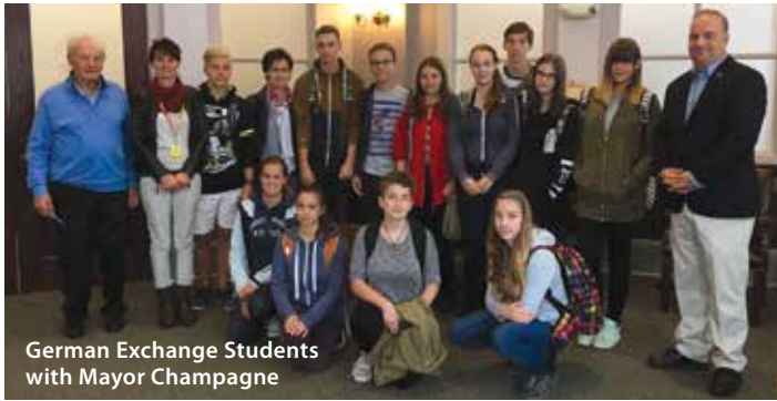
German Exchange Students with Mayor Champagne